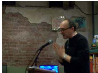
Reading at Malaprops Bookstore

For a complete listing of scheduled participants visit www.westendpoetsweekend.com